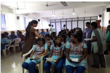
Distribution of pamphlets with instruction of handwash-14.06.2018