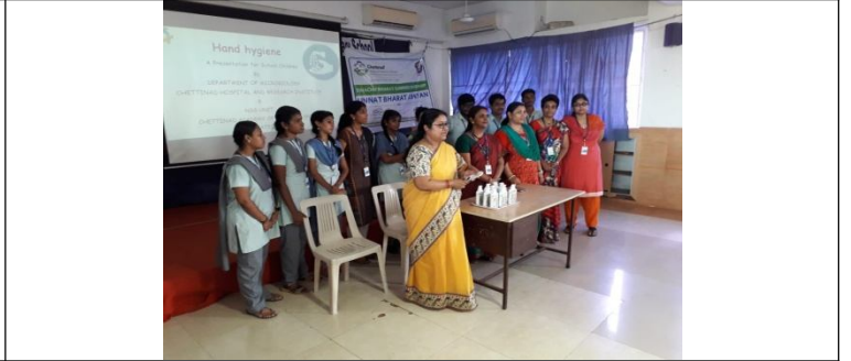
A gift of 10 liquid handwash to Jagannath Vidyalaya by CHRI-14.06.2018