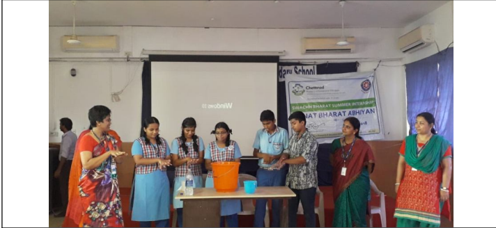
Handwash demonstration for senior secondary students-14.06.2018