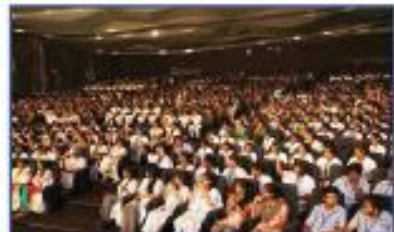
SIGAPI ACHI AUDITORIUM