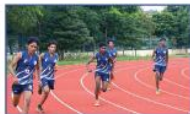
SYNTHETIC TRACK FOR RUNNING