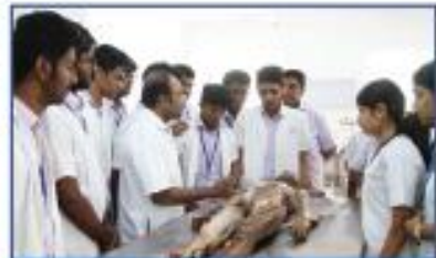
ANATOMY DISSECTION HALL