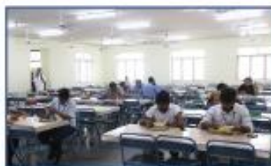
HOSTEL DINING HALL