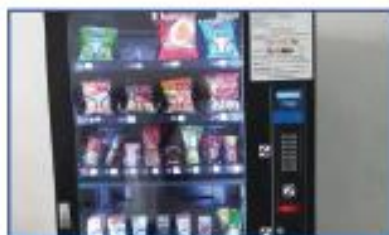
SNACKS VENDING MACHINE