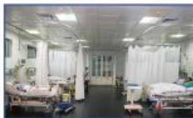
INTENSIVE CARE UNIT (ICU)