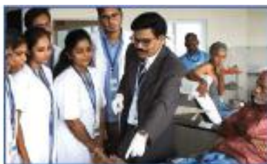
HANDS ON TRAINING