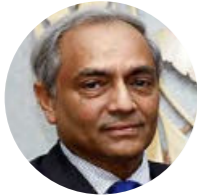
Hon'ble Mr. Justice Mohan Peiris